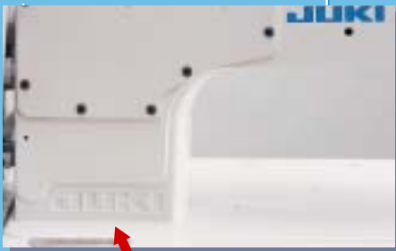
Embossed JUKI mark