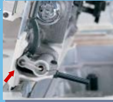
Feed eccentric pin

By thoroughly investigating and modifying the sewing mechanisms in order to achieve low-tension sewing, the machine flexibly responds to various kinds of materials and produces beautiful seams of consistent quality.