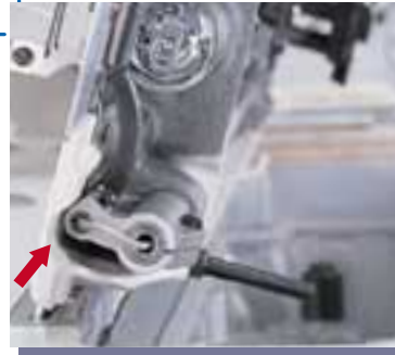
Feed eccentric pin

In addition, the machine is provided with a mounting seat for attachment to improve workability while replacing the attachment and increasing the durability of the machine bed surface.