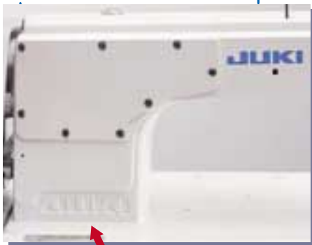
Embossed JUKI mark