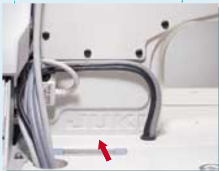
Embossed JUKI mark