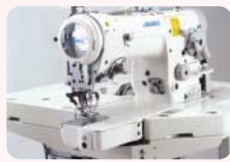
The cylinder diameter is 322mm.