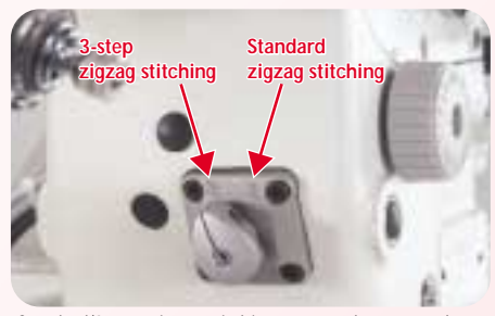
Standard/3-step zigzag stitching pattern changeover lever